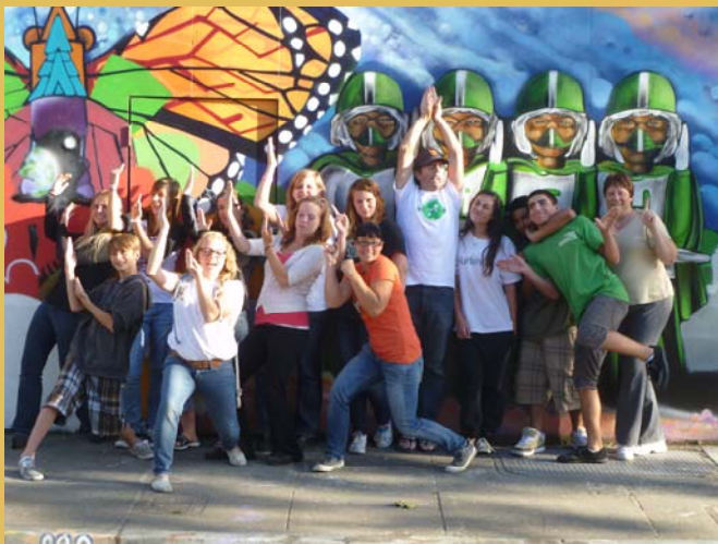
Mission Trip to Bay Area Rescue Mission in San Francisco July 2011

Learning to use the computer and all of its programs can be a daunting task – just when you think you know it all – a new version is available. OR – you think you really do know all about the program – but really you only scratch the surface! We have a variety of courses available for students to take to increase their knowledge of Office 2007/2010 – and you WILL LEARN THINGS you never knew! Did you know you can customize your ribbon bar – wait – what is a ribbon bar???? Did you know that Powerpoint is often confused with a similar program called Powersentence – which everyone knows how to use (kidding!). Mrs. Dart has taken the mundane computerized voice of the old courses and revamped them to make them applicable. We would like all students to take these courses so they know how to use footers, headers, styles, sound files and so much more! The courses available are: INF1030 (Word), INF1050 (Spreadsheet), INF1060 (Database), INF1070 (Powerpoint), INF2020 (Keyboarding) and COM1275 (Digital Manipulation). These courses are guaranteed to increase your computer knowledge (available to parents as well!)